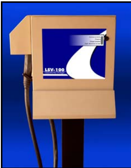
LSV-100 EV Opportunity Charger