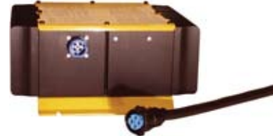
Available with optional Panel Mount DC Connector (72V unit shown), OEM Specific DC Output Cord and Localized AC Input Cord.

QuiQ and the Power in Motion slogan are trademarks of Delta-Q Technologies Corp. Copyright © 2006 Delta-Q Technologies Corp.